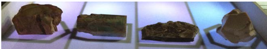
Fig. 1. View of the four geological samples arranged on the interface.

Regarding the system's consistency, it was defined that the act of lifting a sample would identify an interest in knowing more about it, while the movement of putting the sample down would determine the lack of intention to access such contents. From the adoption of this interaction language, we expected to achieve a good visibility and a feeling of instinctive mapping, where each action was associated with the initiation of a specific event. There was also the need to clearly delineate the area corresponding to each sample – named “constraints” – in order to provide the visitors with a clear recognition of where the interaction with the interface leads to results. In order to achieve this, we projected a saver disposed on the surface, where four regions have dimensions and shapes similar to those presented in the four geological samples, as shown in Fig. 1, where the four geological samples are arranged on the interface, illuminated with white colour and delimited by black areas – that were not traversed by the light.