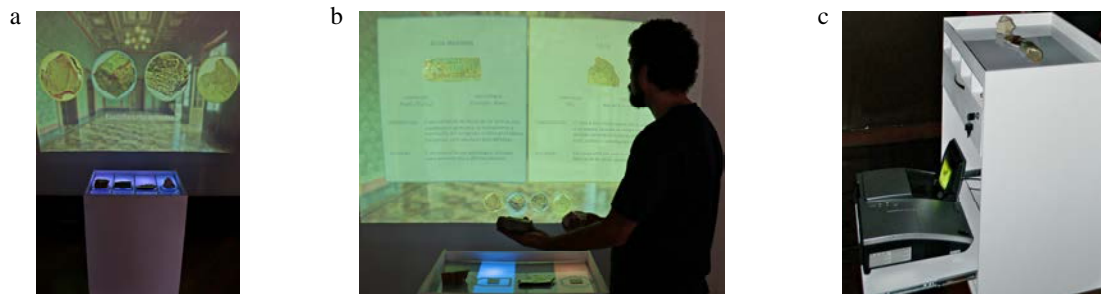
Fig. 3. (a) prototype installation in MM Gerda; (b) a visitor interacting with the interface; (c) implemented system architecture details.

Fig. 3 presents three photographs of the prototype in operation in the main exhibition space of MM Gerda. In it is possible to observe an overview of the installation in the leftmost image (a). On the centre (b), a visitor is handling two geological samples and learning about comparisons of both. On the picture on the right (c), the projector is placed behind the exhibitor, which is responsible for conveying graphical content. In the same picture, it is possible to observe four areas under the surface, where the four bright actuators were placed and, below these, an area reserved for safeguarding of the samples when the interface was disconnected. The computer and the speakers were placed within the cabinet, behind the projector. For the design and construction of the prototype, collaborative working sessions took place inside and outside MM Gerda, with the Museum development team and potential users of the interface.